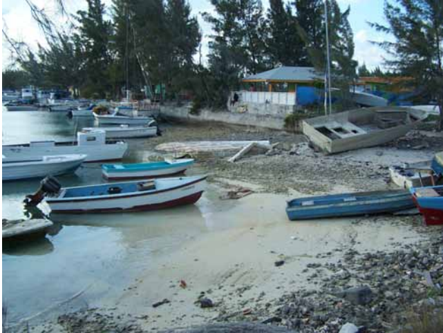
Photo 4: Pocket beach north west of the west bridge between Arawak Cay and New Providence.