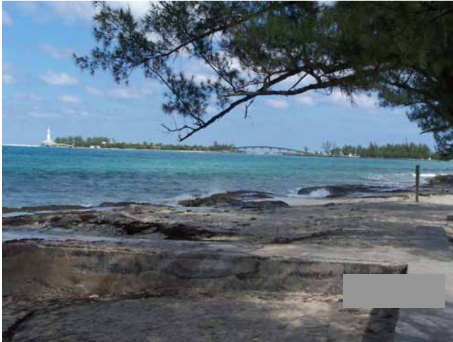
Photo 10: Saunders Beach and west end of Arawak Cay and Silver Cay as seen from West Bay Street at Saunders Beach