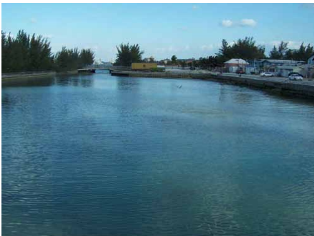
Photo 6: Area between the two bridges between Arawak Cay and New Providence looking east from the west bridge