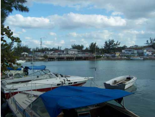
Photo 7: West bridge from the west and boats moored on the south side of Arawak Cay