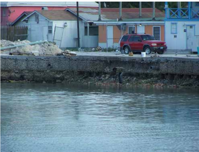
Photo 2: Damaged gabion basket wall and man cleaning conch behind the fish fry on the north shore of New Providence between the two bridges to Arawak Cay.