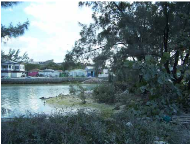
Photo 5: Area of button wood on the north east side of the west bridge between Arawak Cay and New Providence