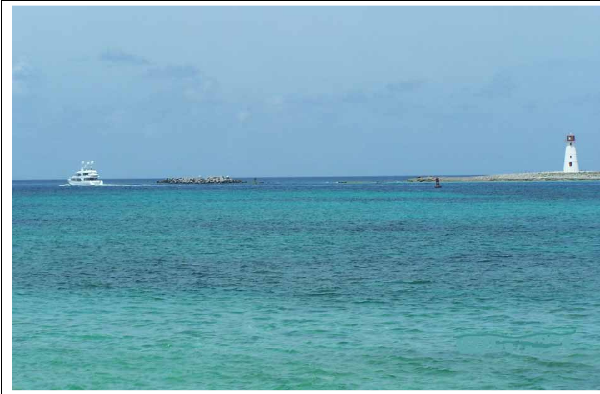
Photo 7: Eastern entrance channel with damaged breakwater and Paradise Island lighthouse