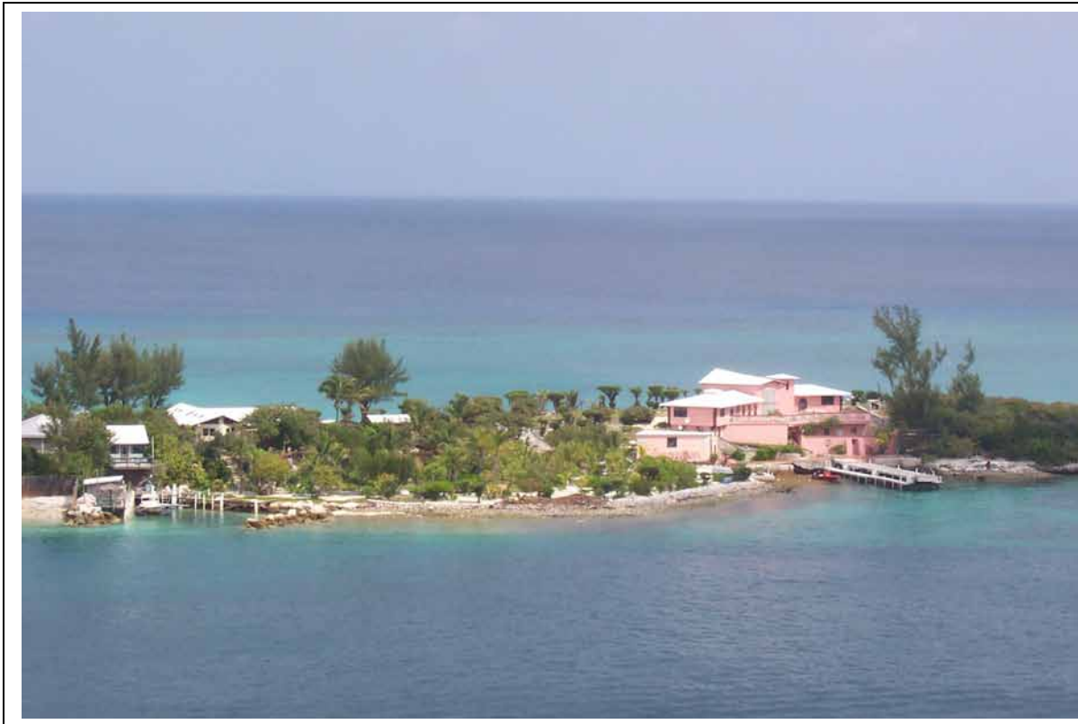
Photo 8: Residences on Paradise Island (south side) near dredge area 5